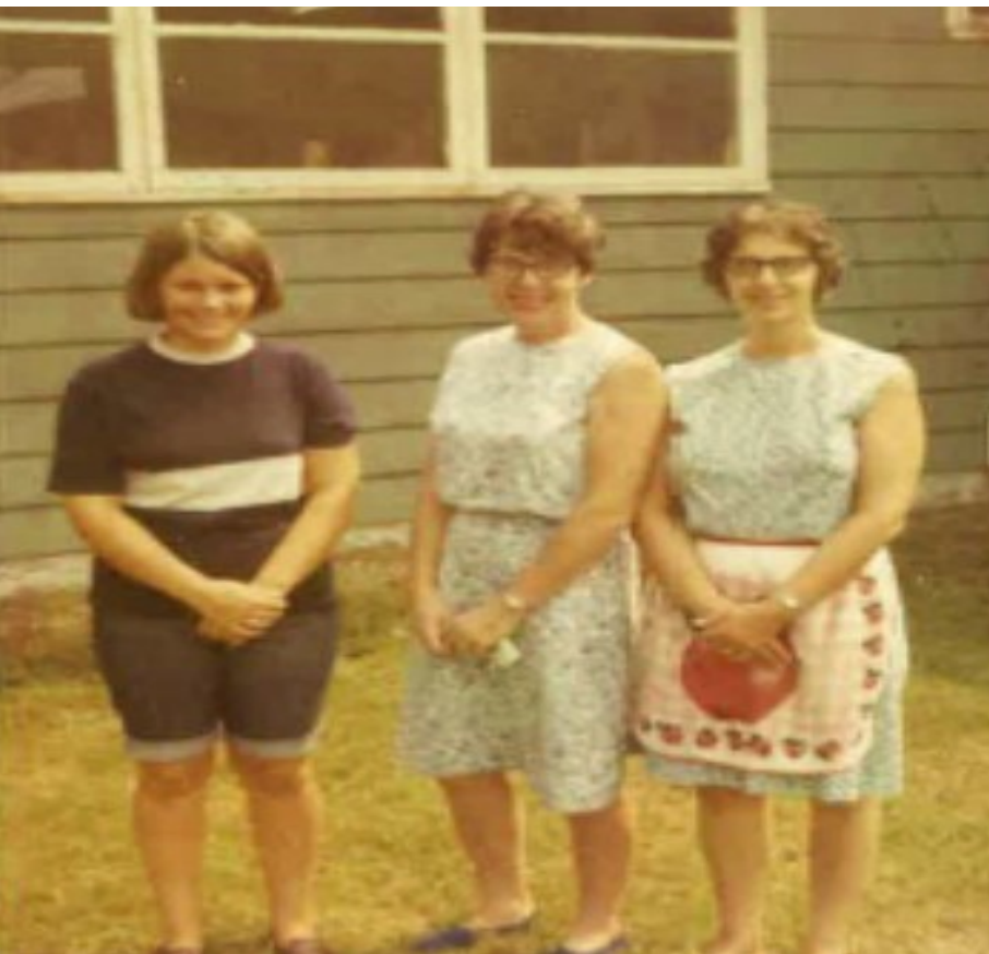
Typical clothing seen at Camp in the early days

And it's even more complicated for girl camper clothing, which stretches (quite literally) from ultra skimpy fashion, to short shorts and even bikini tops. Some modest fashion is not even available in the typical clothing store, department store or even at your Walmart