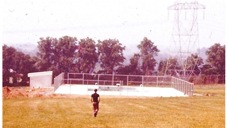
The first pool, built in 1974