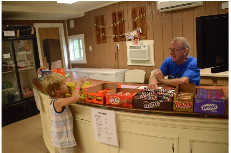
Yes! It's Canteen Time!