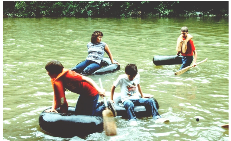
Fun in the Creek