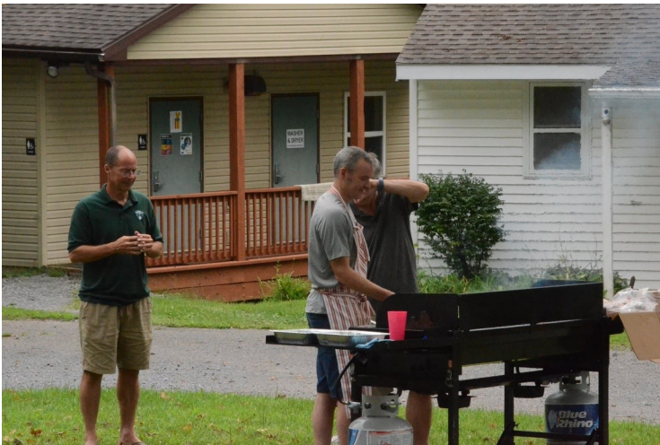
Our Chairman Supervising the Grilling... with Contemplation