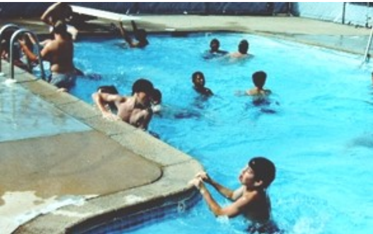
Fun in the pool after diving board was added