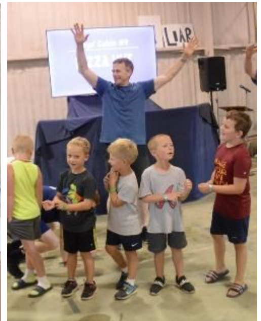
God is so big...